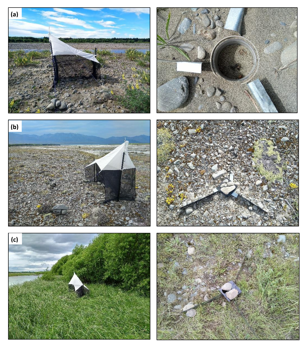
Figure 1: Examples of malaise (left) and pitfall (right) traps set up on the Ashley (a) , Cass (b) and Aparima (c) Rivers.