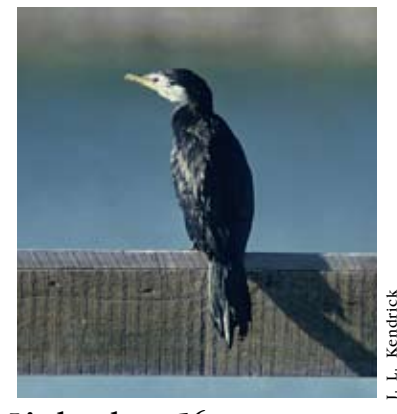
Little shag 56 cm