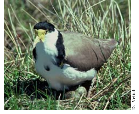
Spur-winged plover 38 cm