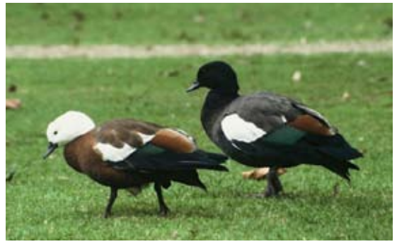
Paradise shelduck 63 cm