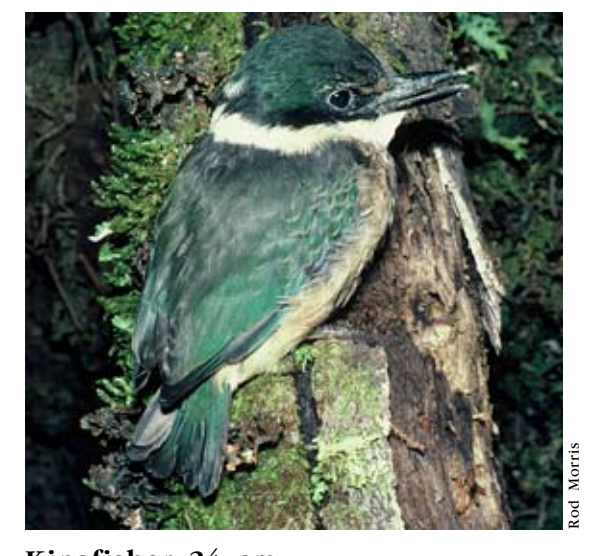
Kingfisher 24 cm