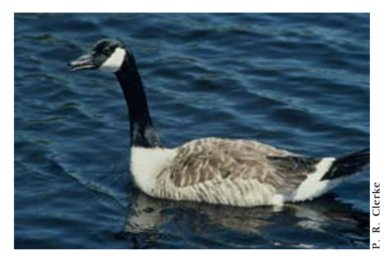
Canada goose 100 cm