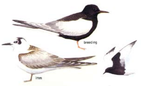
Illustration: Ornithological Society of New Zealand Inc.