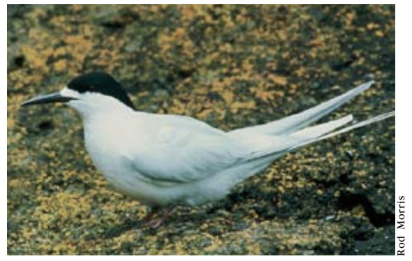
White-fronted tern 42 cm