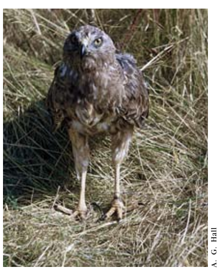
Harrier 60 cm