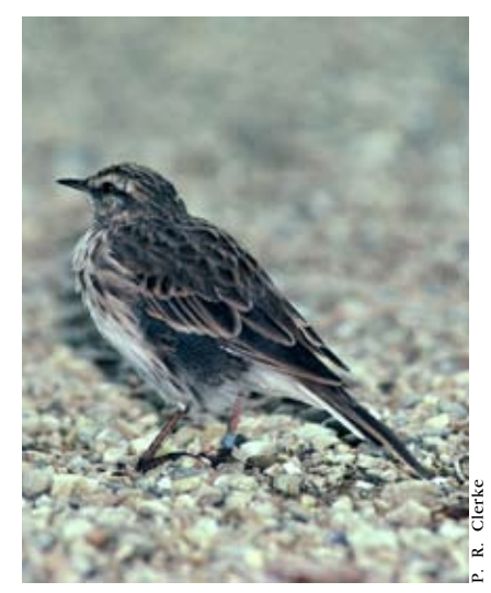
NZ pipit 19 cm