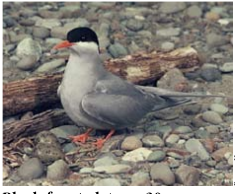
Black-fronted tern 30 cm