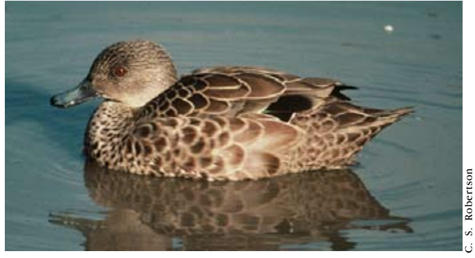
Grey teal 43 cm