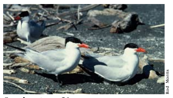
Caspian tern 51 cm