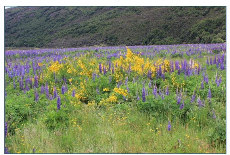
Broom at Turkey Flat (site #4)

Broom typically lives for 10 to 12 years, though 15 year-old bushes have been recorded<sup>15</sup>. Other vegetation, including native species, can establish within and regenerate through stands of broom, though replacement of broom is slower on thin stony soils subject summer to drought<sup>16</sup>.