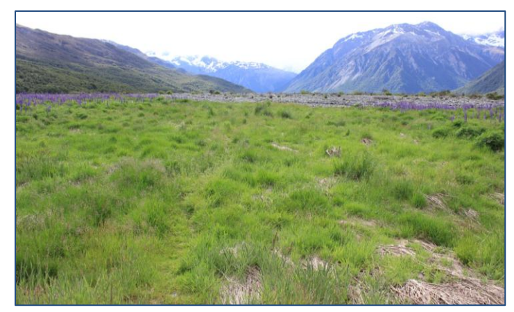
Sprayed lupin strip after one year.

This suggests that once infestations at stable sites are controlled, they will most likely be replaced by naturalized grasses. Extant lupin seed does not appear to readily germinate within a dense grass sward. New lupin seed will appear only if deposited by flood waters or propelled onto the site from nearby lupin plants.