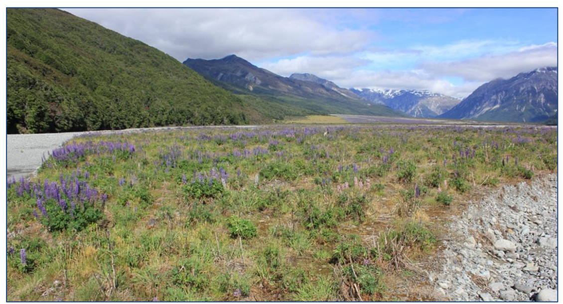
Russell lupin on a stable island of the Waimakariri River.

Seeds of Russell lupin are dispersed by propulsion from the pod and transported by water. Seeds are also likely to be dispersed by mammals and birds. An important agent of dispersal is humans carrying the attractive flowers to, or deliberately sowing seed at, new locations.