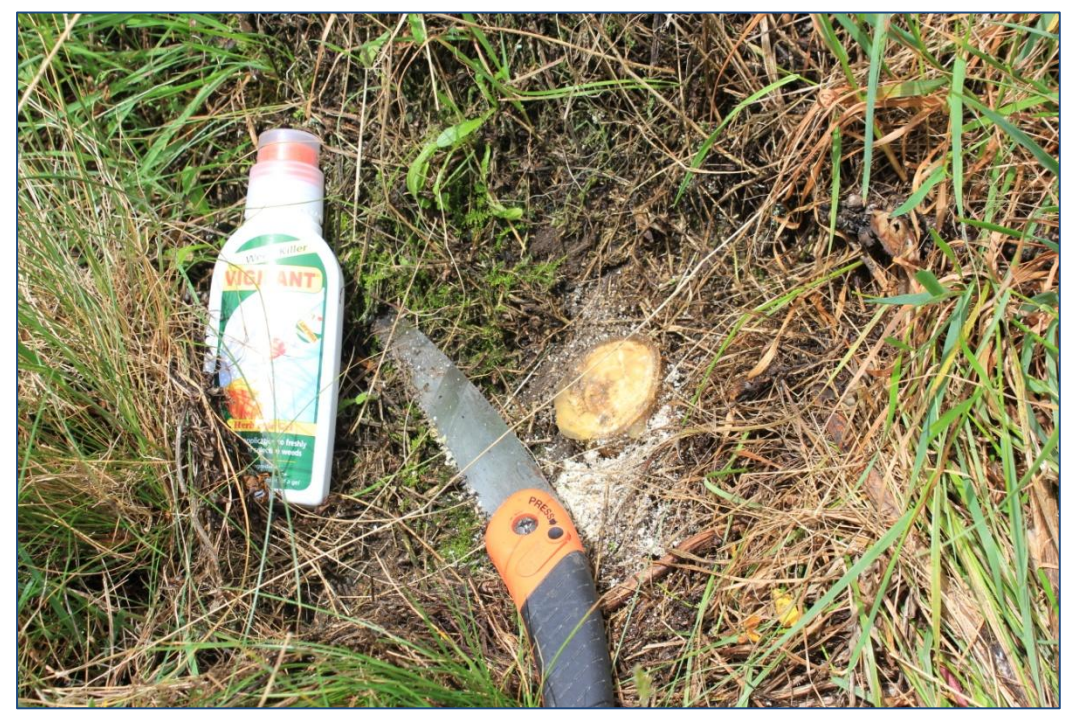
Broom bush, cut and treated with herbicide gel.