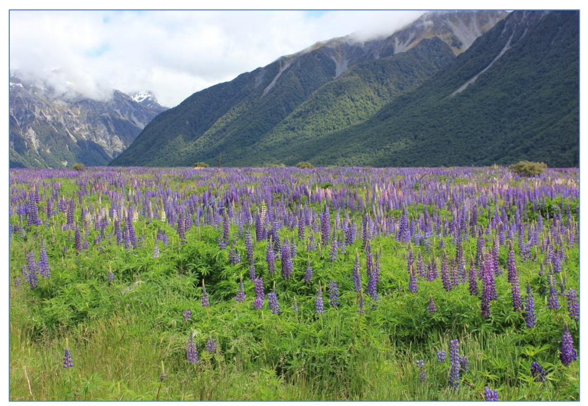
The main infestation of Russell lupin at Turkey Flat (Site #3)

This report is presented in two parts, reflecting the two main objectives of the project. The first part (Section 3) describes the characteristics and extent of infestations of each of the invasive weed species. Other less invasive species and notable indigenous species are listed. The second part (Section 4) discusses important weed control issues and proposes objectives, goals and priorities for weed control in the upper Waimakariri River valley.