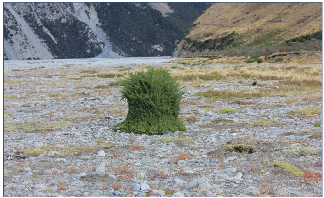
Browsed gorse bush, Wilberforce River.

Gorse is probably the most important plant pest in the country and is widespread in Canterbury. Gorse was recorded at only two locations in the upper Waimakariri valley during this survey: beside the vehicle track at Klondyke Corner (site #19) (treated with prills) and alongside State Highway 73 (site #40). There is also an old infestation site on Turkey Flat at the up-valley (west) end of O'Malley's Track (site #46).