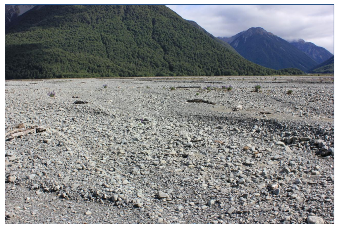
Sparse Russell lupin infestation on the open bed of the Waimakariri River (Site #12).

It appears that one or two herbicide treatments may be sufficient to control the main dense areas of lupin at Turkey Flat. Ongoing, annual effort will be required to control the more scattered infestations on new and unstable surfaces. However, the amount of effort will reduce annually as the amount and viability of lupin seed declines.