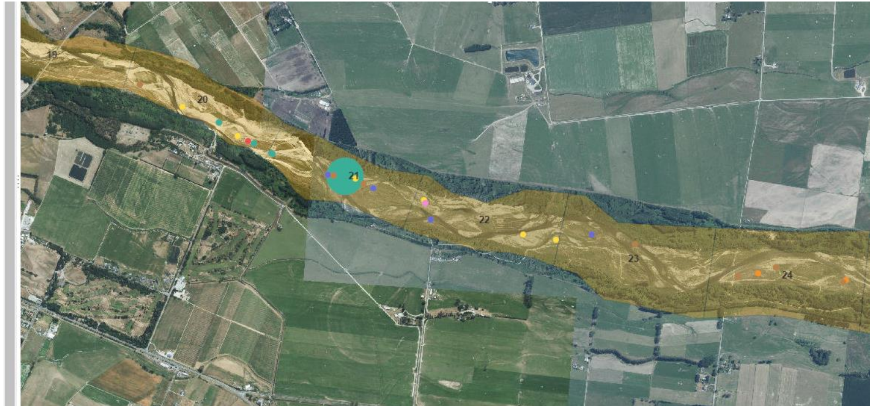
Figure 3 Recorded observations of bird counts along river KM sections 19 – 24 (start of the Pleasant Point bridge to SH1 bridge section).