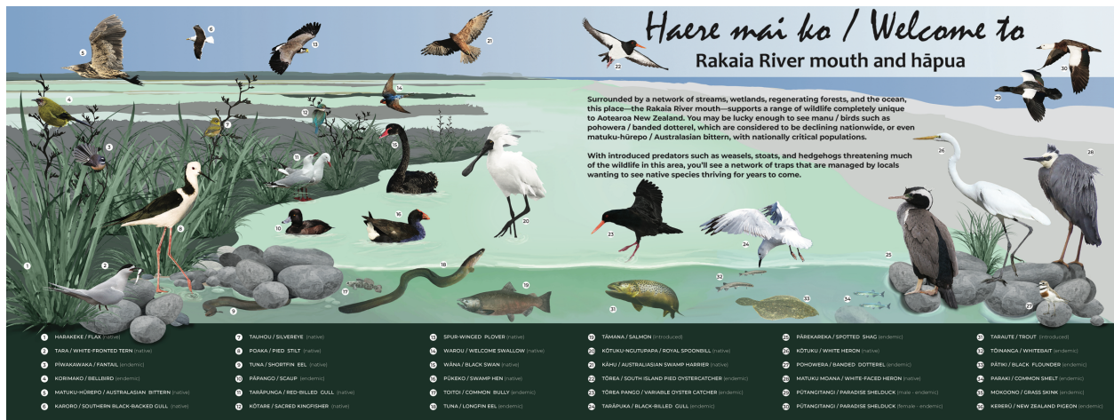
Final Rakaia River mouth 2-panel sign completed November 2024

BRAid website statistics for the period 01 July 2024 – 30 November 2024. Total visitors 27,761 viewed an average slightly more than 2 pages/person (total 58,399). The dotted lines show weekly trends.